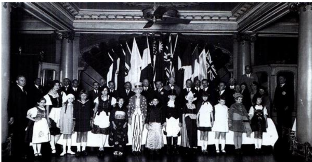
▲ Rotary flourished in China before World War II. Above, the Shanghai club, chartered in 1919, celebrates International Flag Day in 1929.